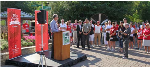
OSU Extension 100 th Anniversary Celebration

Special thanks go to the CFAES Office of Advancement, Events and Programs; the CFAES Office of Government Relations; and OSU Extension Administrative Cabinet for their support and participation in the event.