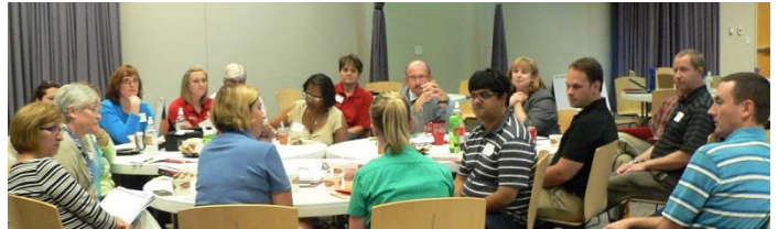
4-H Youth Development in the City, Working Group Discussion